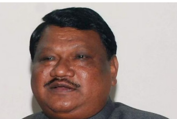
'thrown to Bay of Bengal after the next election'.

The first Tribal Affairs Minister in the Atal Behari Vajpayee government at Centre, Oram said, "Our