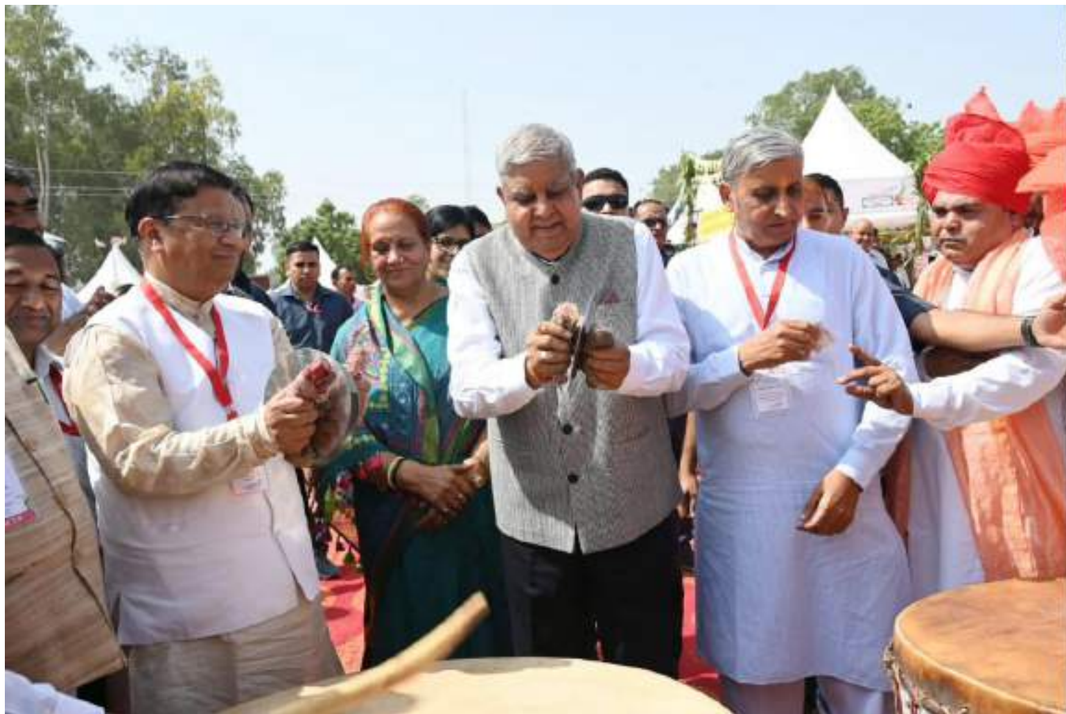
The Vice President, Shri Jagdeep Dhankhar playing traditional musical instruments at the Krishi Vikas Mela organized at Chaudhary Charan Singh Haryana Agricultural University in Hisar, Haryana