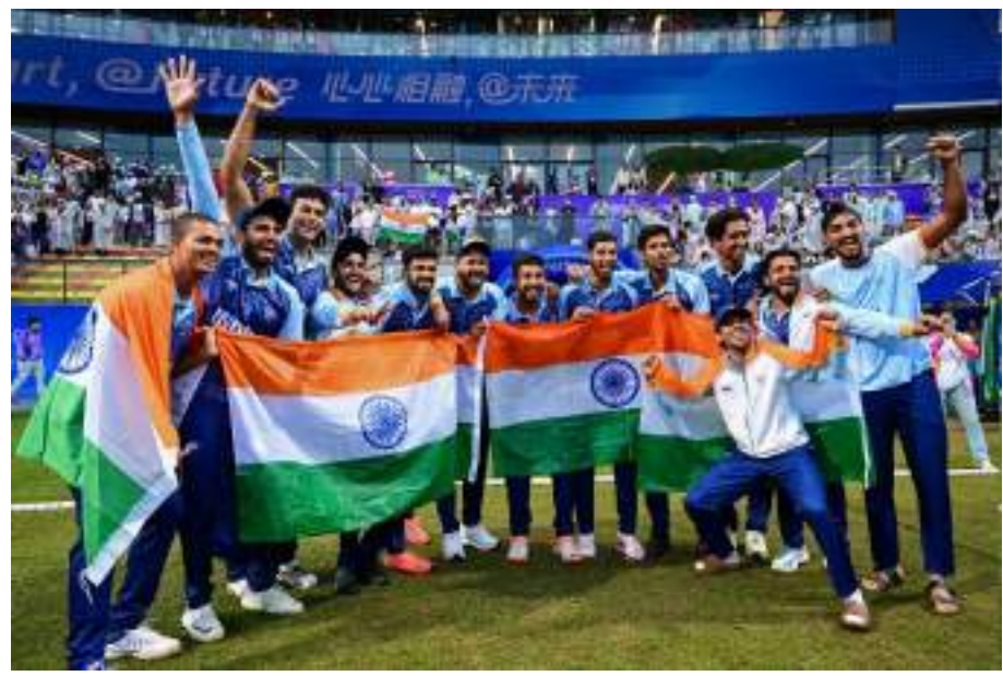
India celebrate their gold-medal win

"I don't think that this World Cup is going to be decided by whether you read the pitch correctly, it's going to be decided on the way you play on those pitches, on the variety of conditions that you are going to get. I think adaptability is going to be a huge challenge in this World Cup and how teams adapt to various venues, conditions and pitches and various bowling that they will have to face. And I think [that] will probably decide how successful teams are."