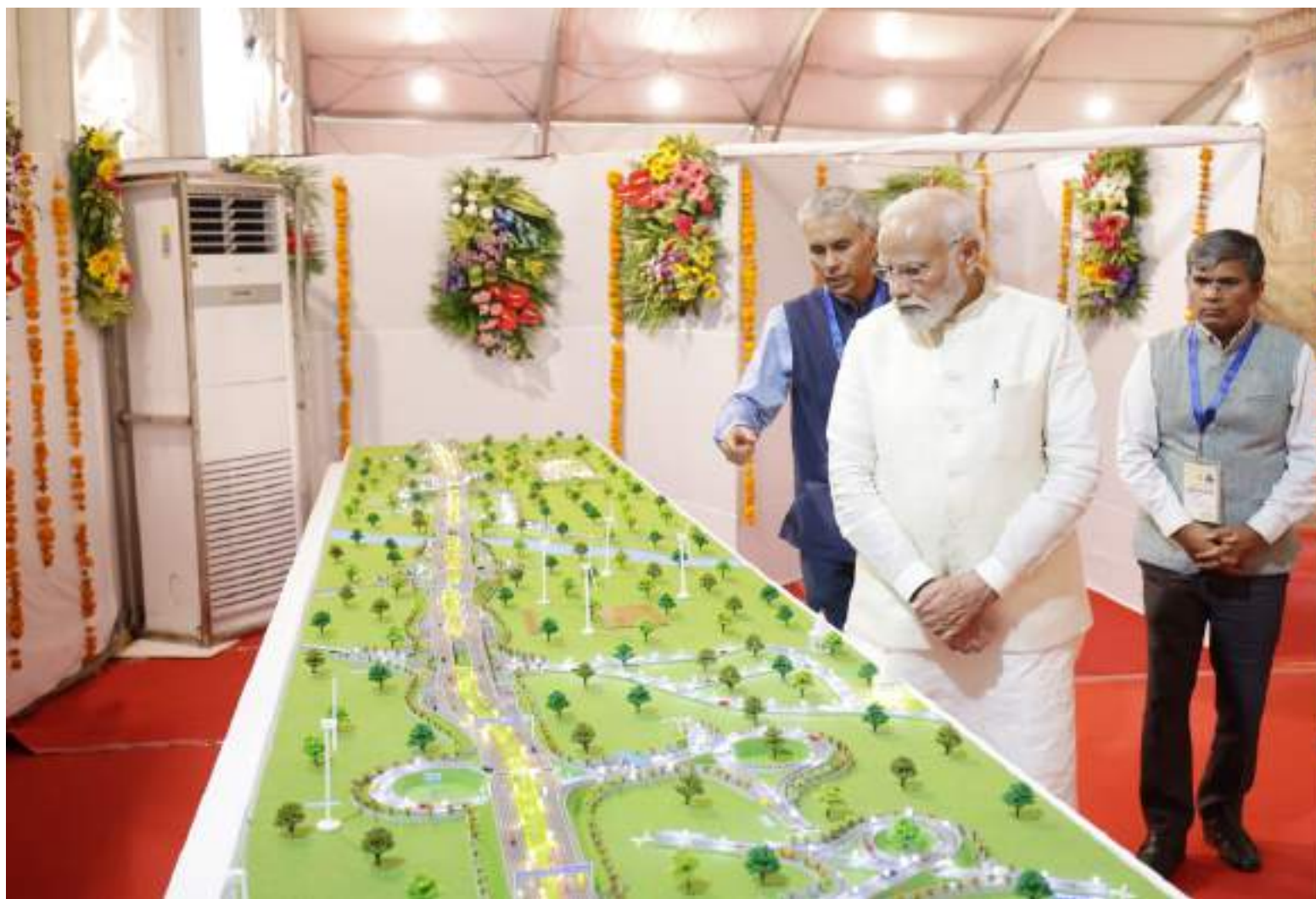
PM visits an exhibition at the laying foundation stone of various projects at Gwalior, in Madhya Pradesh

consumption, conservation of resources, and the need to protect the natural world for future generations," Chief Justice Chandrachud said. "As we remember and pay our tribute to Mahatma Gandhi on his birth anniversary, let us re-dedicate ourselves to upholding his principles and working towards a more peaceful, just, and sustainable world," he said.