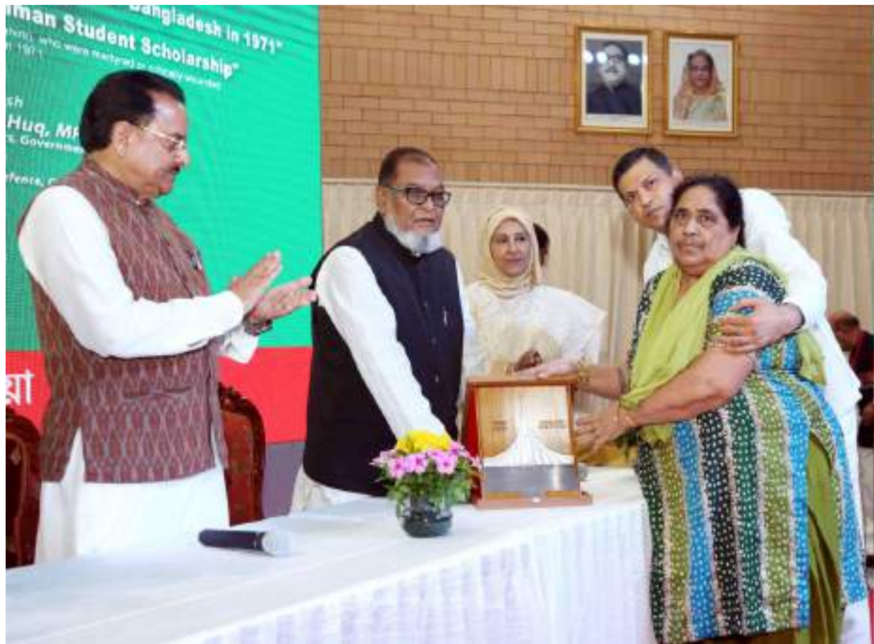
The Minister of State for Defence and Tourism, Shri Ajay Bhatt pays tribute to Indian Soldiers of Bangladesh Liberation War of 1971 at a ceremony organised by Bangladesh High Commission, in New Delhi

messages either on mobile or through social media, making threatening and anonymous calls, persistently calling the borrower/guarantor, and making false and misleading representations. "Further, the REs and their Recovery Agents are barred from calling the borrower/guarantor before 8:00 a.m. and after 7:00 p.m. for recovery of overdue loans," the RBI has proposed. The draft, on which the RBI has invited stakeholders' comments by November 28, 2023, also said the REs should have in place a management structure to monitor and control their outsourcing activities.