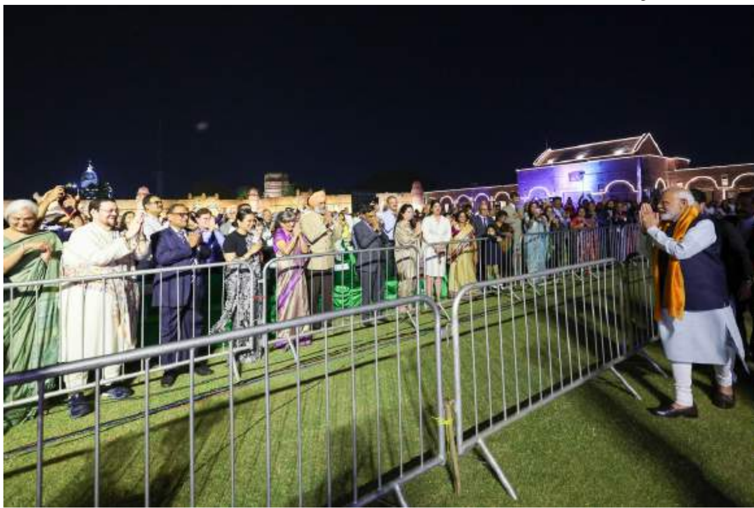
PM participates in a programme marking the 125th Founder's Day celebration of 'The Scindia School' in Gwalior, Madhya Pradesh on October 21