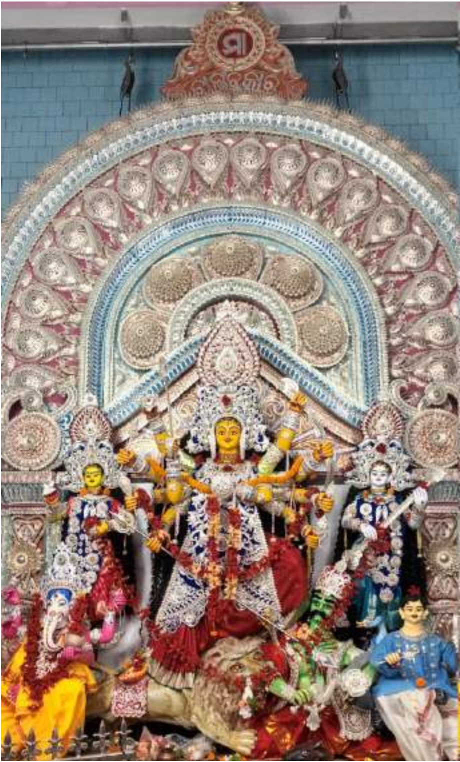
Cuttack: Mother Durga is worshipped