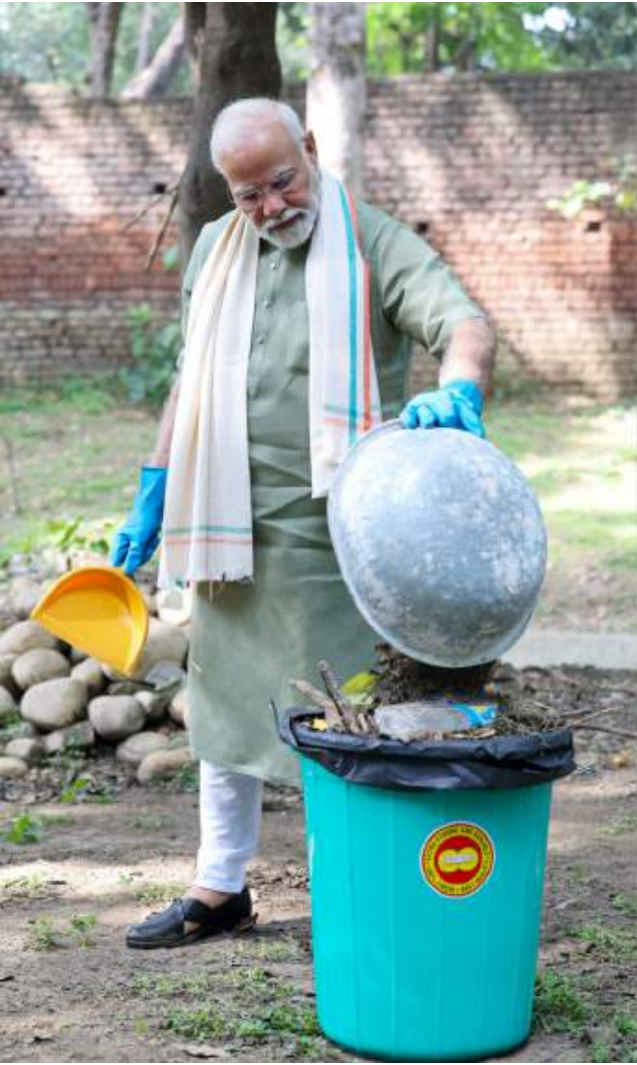
M participated in the special cleanliness programme 'Ek Taarikh, Ek Ghanta, Ek Saath' (Shramdaan) under Swachhta hi Seva campaign in the remembering the inspirations of Father of the Nation Mahatma Gandhi, in New Delhi