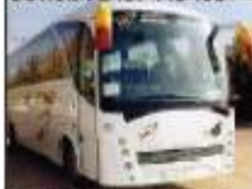
TOURS &amp; TRAVELS

Required Single / Double / Triple Stored North/East facing building at Puri. Contact 9437143483