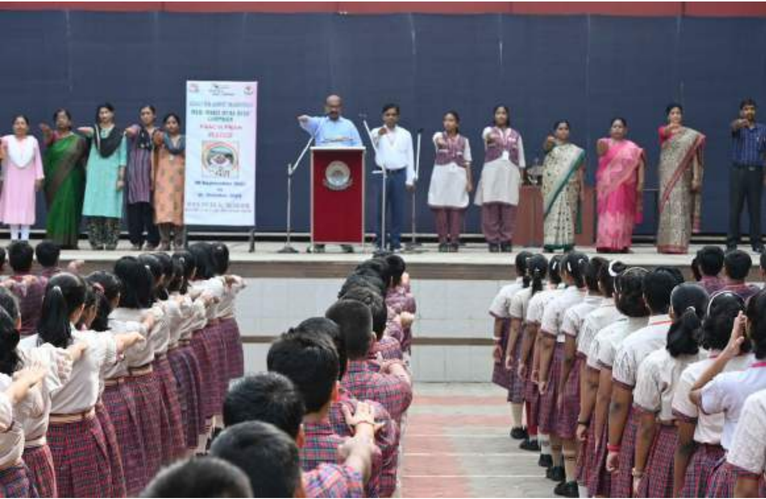
'Amrit Kalash Yatra' under 'Meri Maati Mera Desh': A culminating touch to 'Azadi Ka Amrit Mahotsav' by DAV, Kalinga Nagar, Bhubaneswar.