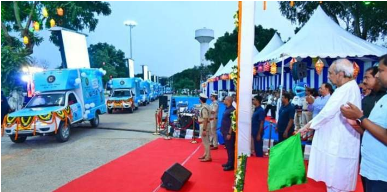
Chief Minister Shri Naveen Patnaik flagging off 34 Cyber Safety Rathas at Kalinga Stadium