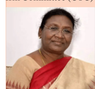
India, Smt Droupadi Murmu at the Rashtrapati Bhavan on 29 October. They are in India to attend the Special Meeting of the UNSC CTC held in Mumbai and Delhi on

New Delhi(KCN): Heads of Delegations of the United Nations Security Council's Counter Terrorism Committee (CTC) called on the President of