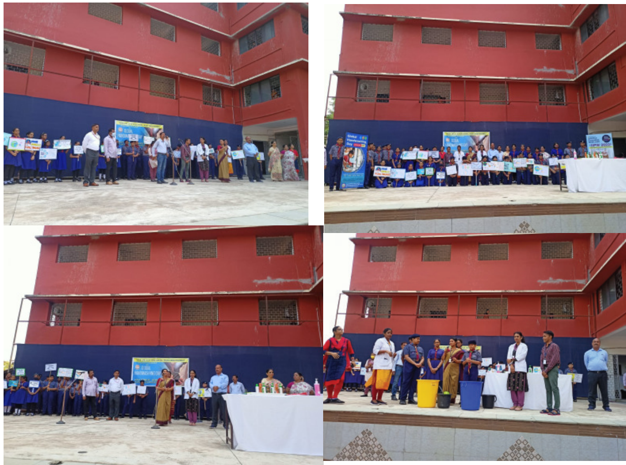
AWARENESS PROGRAMME ON HAND HYGINE ORGANISED AT DAV PUBLIC SCHOOL, KALINGA NAGAR TO MARK THE GLOBAL HAND WASHING DAY