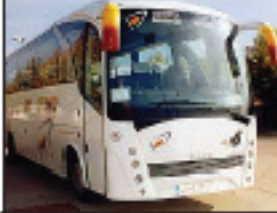
TOURS & TRAVELS

Required Single / Double / Triple Storiied North/East facing building at Puri . Contact 9437 143 483