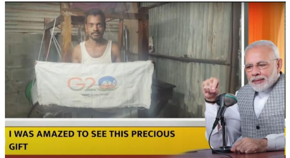
I WAS AMAZED TO SEE THIS PRECIOUS GIFT

an opportunity for us. We have to focus on global good, be it peace, unity or sustainable develop-