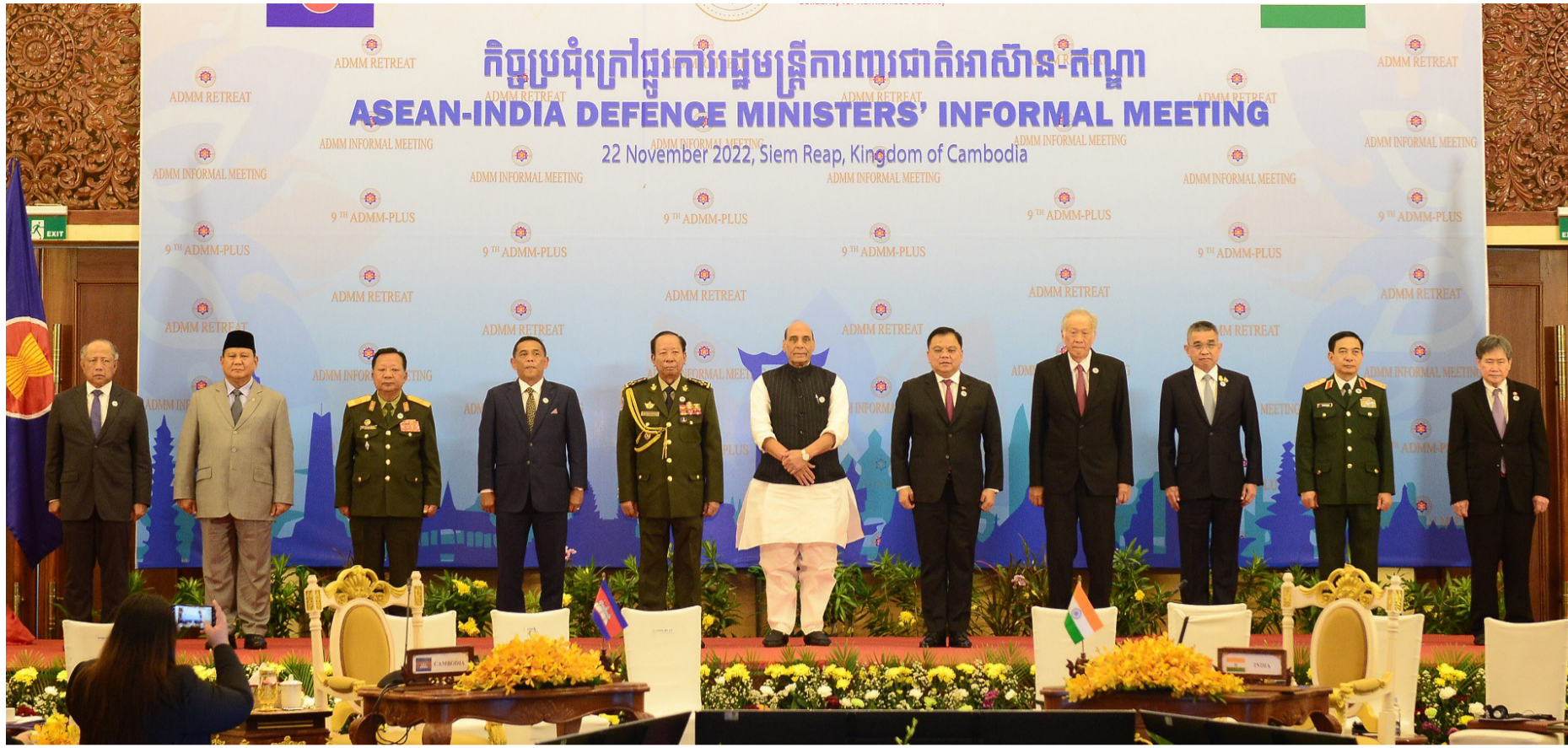
The Union Minister for Defence, Shri Rajnath Singh at the maiden India-ASEAN Defence Ministers' Meeting, in Siem Reap, Cambodia