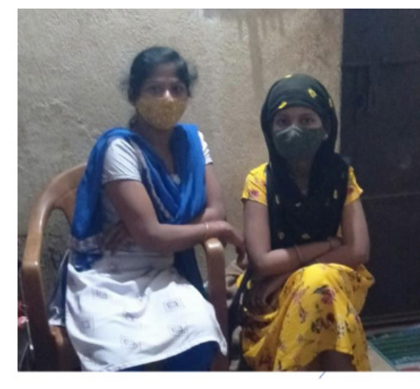
The most common cause of TB stigma is the perceived risk of transmission. (Told by

sensitize and educate the community people and support to create environment. Through CAF the data collection process, she inspired to work with PwTB and felt her past she was lived in. She told this work process supports her when she adopted qualitative approach and aimed to asses knowledge, attitude and belief about TB from each individual she met over the period. As a result, in between total number 96 PwTB (Male - 56 and Female - 41) ,488 family members and 1745 from the general population met by her. More than 73% of PwTB were women touched by her in this working year. As a TBC, her observation is TB-related to stigma are associated with poverty, lack of educational status, migration and lack of awareness about TB. As TB considered a curse on a family, as the illness often affects multiple generationswe know that this is simply because TB is