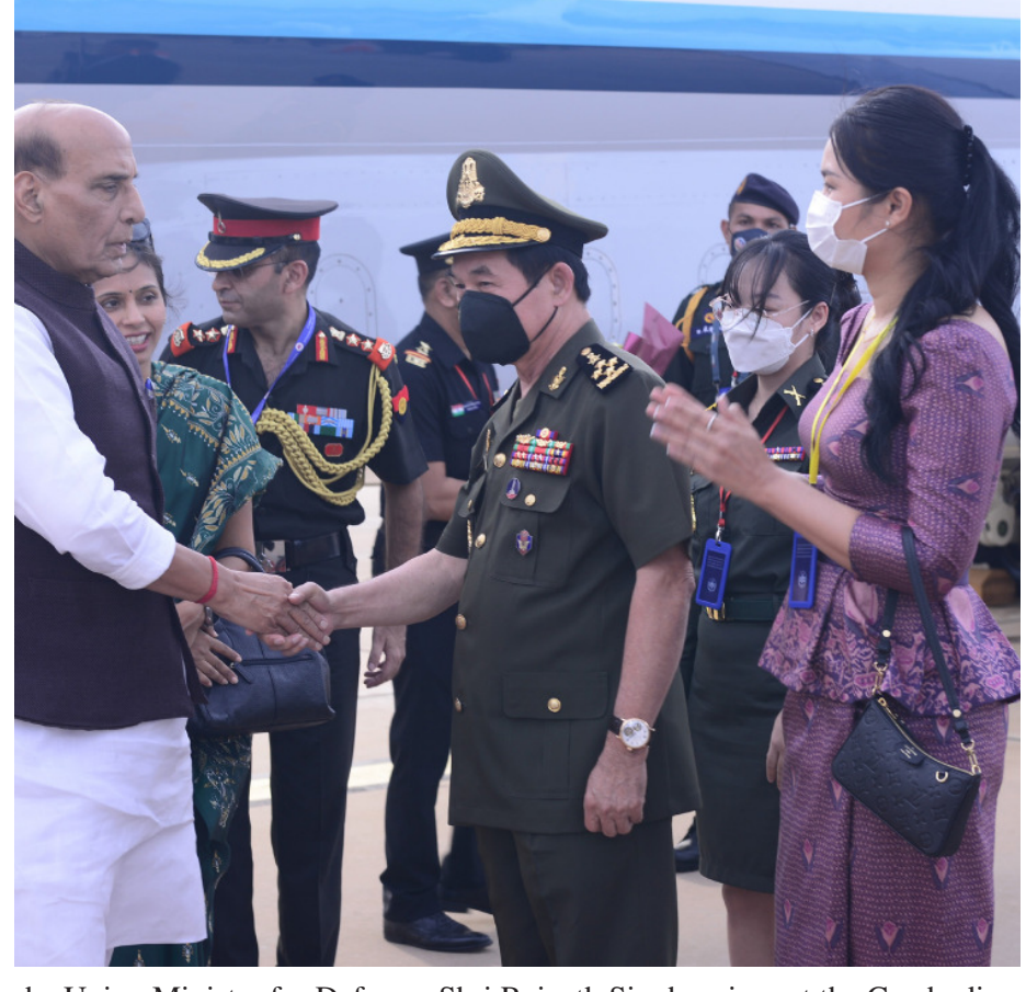
to attend the ASEAN Defence Ministers Meeting

The fire at a Sinopec Shanghai Petrochemical Co. plant in the outlying Jinshan district sent thick clouds of smoke over a vast industrial zone as three fires blazed in separate locations, turning the sky black. And last year, a gas blast killed 25 people and reduced several buildings to rubble in the central city of Shiyan.In March 2019, an explosion at a chemical factory in Yancheng, located 260 kilometres (161 miles) from Shanghai, killed 78 people and devastated homes in a several-kilometre radius.