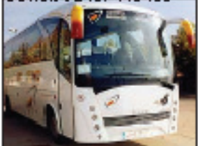
TOURS & TRAVELS

Required Single / Double / Triple Storiied North/East facing building at Puri . Contact 9437 143 483