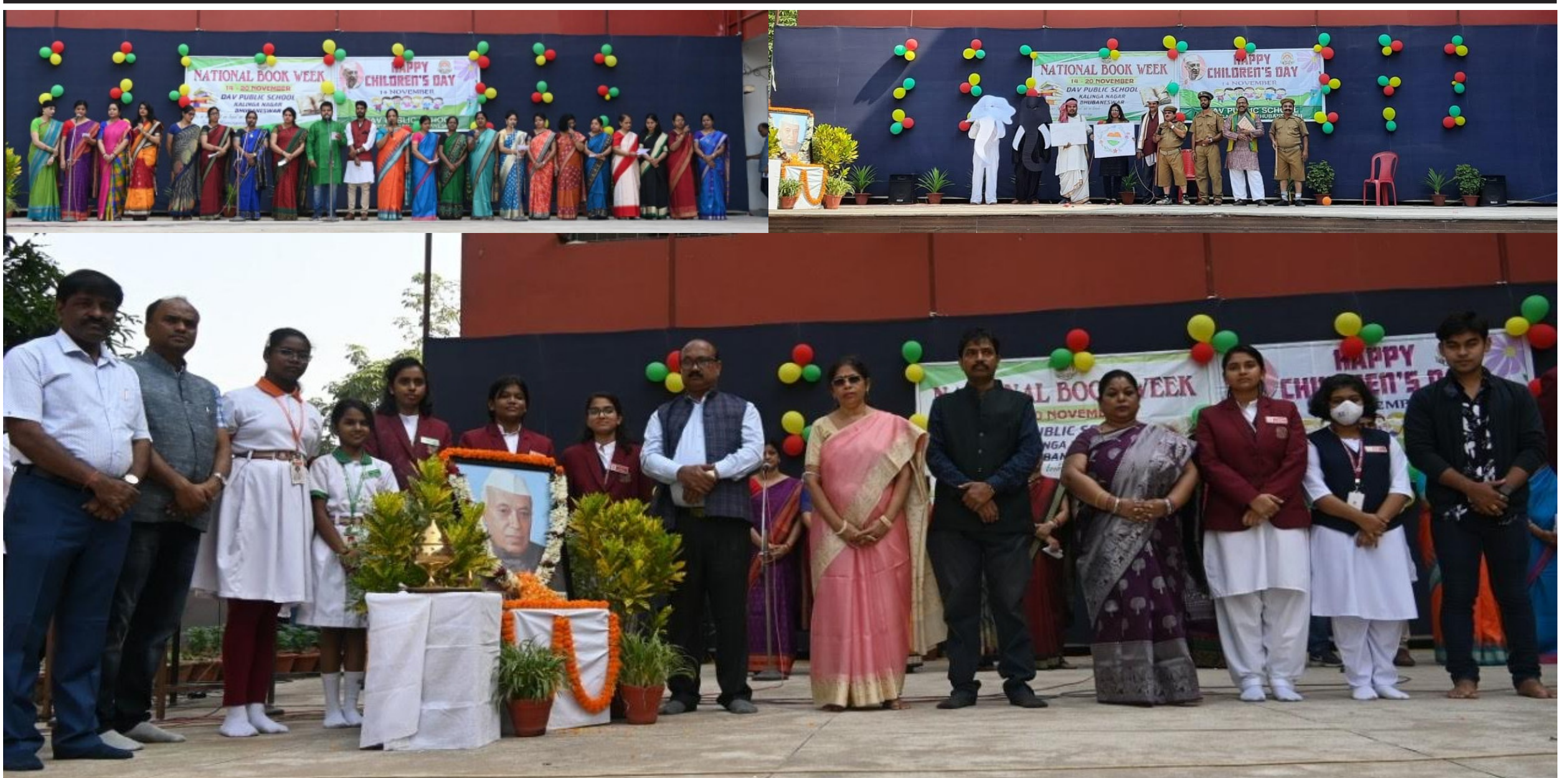
Children's Day celebrated at DAV Public School, Kalinga Nagar on this occasion Chorus, Dance and a Skit on elephant preservation were performed by the Teachers