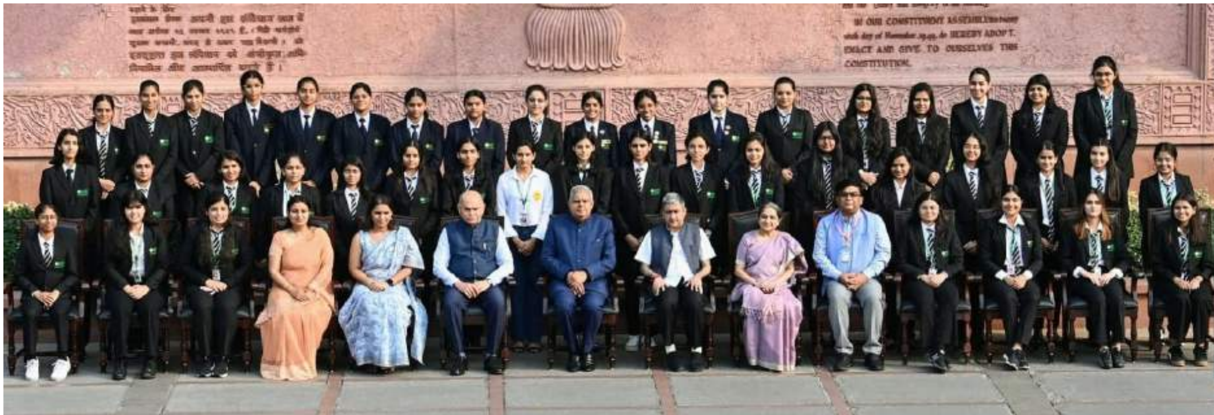
The Vice President, Shri Jagdeep Dhankhar in a group photograph at Parliament House Complex, in New Delhi