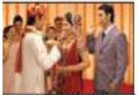
MATHRIMONIAL BRIDE WANTED

Saving 10,000/- for high return, extra earn and foreign trip opportunity, 9238904001. Independent business work from home, training in Singapore, 9338014287.