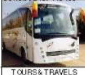
TOURS &amp; TRAVELS

Required Single / Double / Triple Storied North/East facing building at Puri. Contact 9437143483