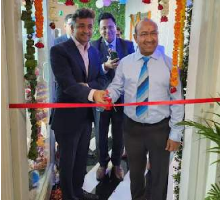
a seamless learning experience to the students of its hybrid courses.Aakash BYJU’S has been constantly scaling up its op-

Delhi: Aakash BYJU’S, India’s leader in test preparation services, today launched its third flagship in Delhi, after South Extension and Janakpuri, at Vasant Kunj, responding to the growing demand for its NEET, JEE and Foundation courses from the Capital. This new addition to the Aakash BYJU’S expanding pan-India network of centres, currently totaling 330+ in 24 states and union territories, reflects the institute’s commitment to reaching its standardised direct coaching services to students where they live. Located in an area of 14952 sq. ft. of space in a prime location at Ambience Tower, Second Floor, Plot No 3, Sector-A, Pocket II, Vasant Kunj, the flagship has 17 classrooms and can offer direct classes to 2000+ students. Featuring connected and smart classrooms, it can also provide