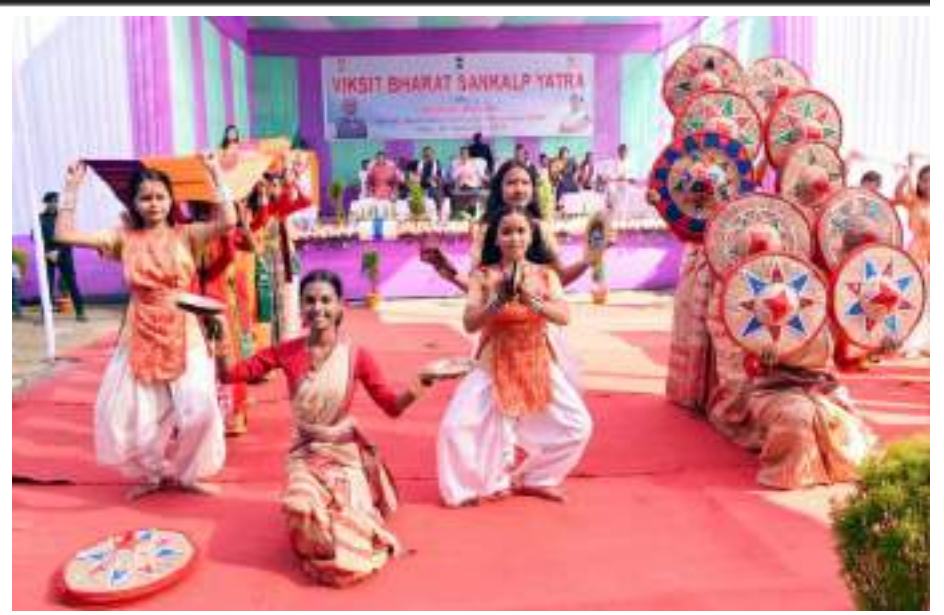
Children performing traditional dance at a Programme on Viksit Bharat Sankalp Yatra at Baksa, in Assam