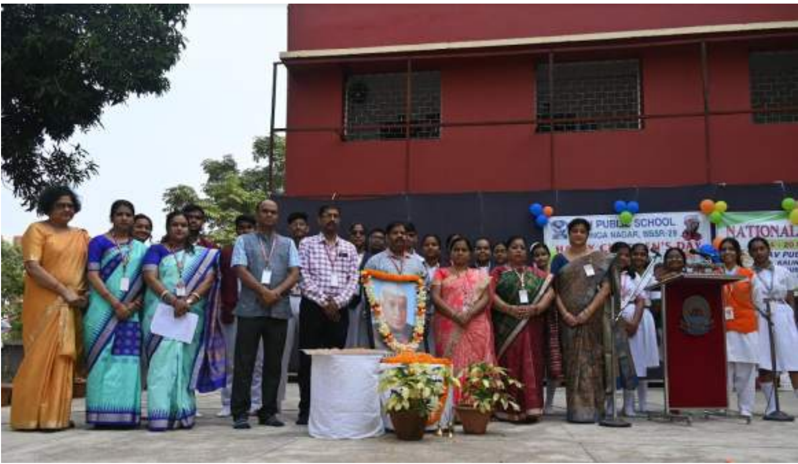
CHILDREN'S DAY CELEBRATED AT D.A.V PUBLIC SCHOOL, KALINGA NAGAR. ON THIS OCCASION CHORUS, DANCE AND A SKIT WERE PERFORMED BY THE TEACHERS.