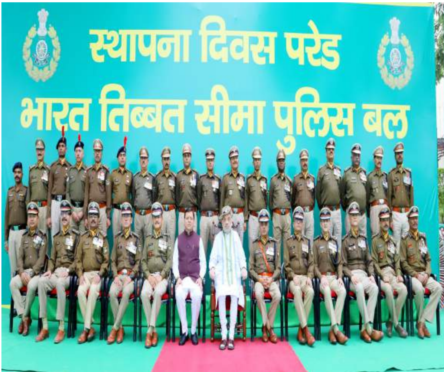
The Union Minister for Home Affairs and Cooperation, Shri Amit Shah at the 62nd Raising Day Parade ceremony of the Indo-Tibetan Border Police (ITBP) at Dehradun, in Uttarakhand