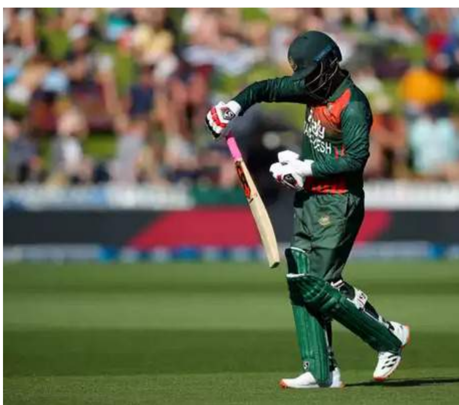
Furthermore, the tourists are yet to practice at the venue - where the ODIs

are a good team in these conditions and are quite familiar with it. "We hope that it will be a good and competitive series," he said. Bangladesh are scheduled to play at Chelmsford from May 9 while the remaining two matches of the series, which are a part of the ICC Super League, are slated to be played on May 12 and 14 respectively at the same venue. Even though Bangladesh reached England by May 2 due to bad weather, visitors could not prepare as per their expectation while the only practice game against Ireland Wolves got washed away due to rain on May 5.