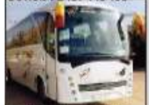
TOURS & TRAVELS

ACCOMMODATION WANTED Required Single / Double / Triple Storied North/East facing building at Puri . Contact 9437143482