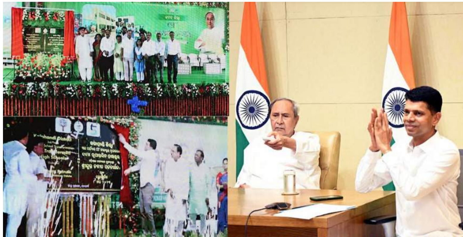
Chief Minister Shri Naveen Patnaik Dedicating High Schools of 4 Districts under 3rd Phase 5T High Schools transformation programme through video conferencing