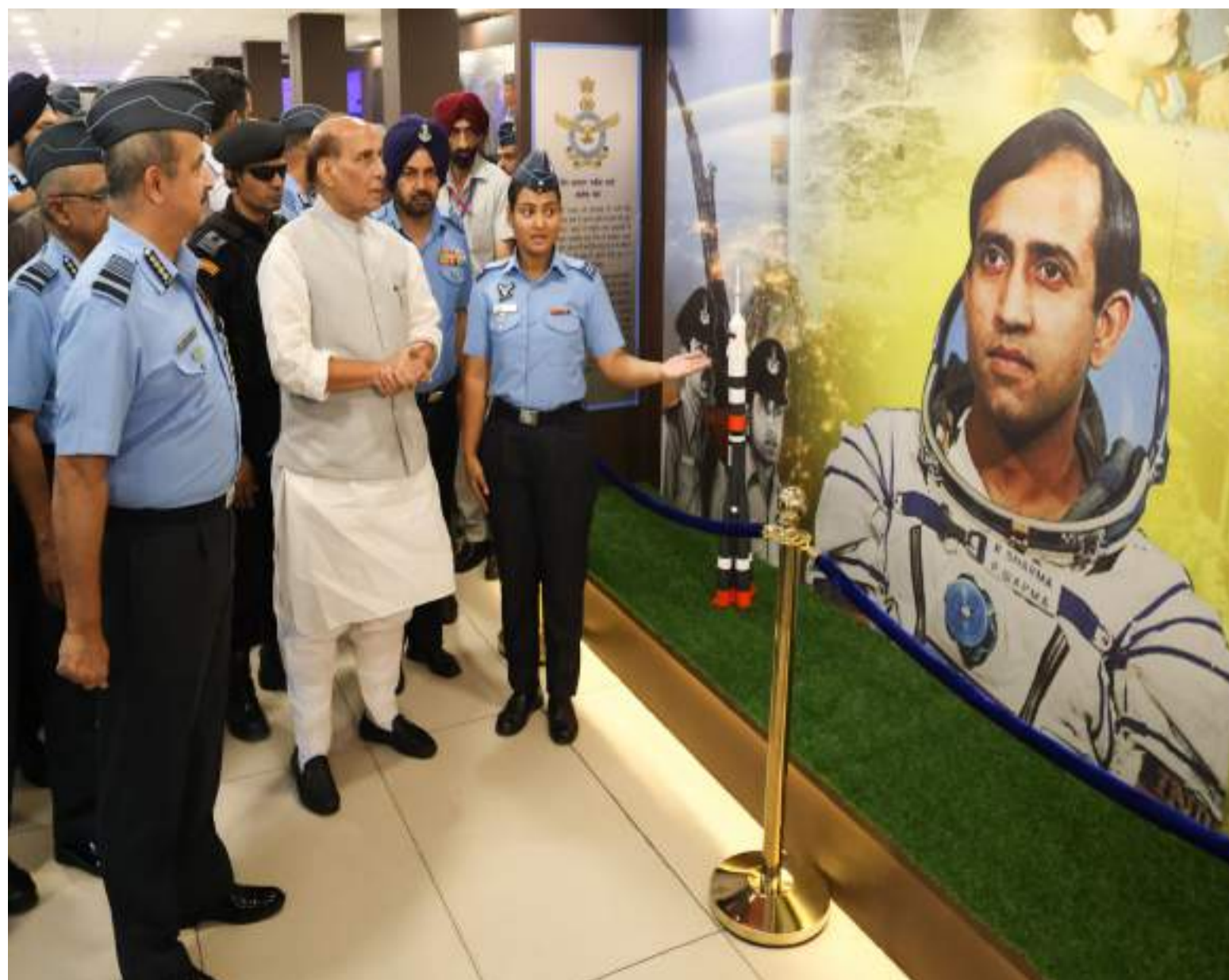
The Union Minister for Defence, Shri Rajnath Singh visit to Indian Air Force Heritage Centre, in Chandigarh

An Airports Authority of India (AAI) official said various measures were being taken to help people at the Imphal airport, which has seen a huge rush of passengers trying to flee the state amid the ethnic violence that began on May 3. The AAI has set up a helpdesk at the airport for the stranded passengers. The Imphal airport served 10,531 passengers between May 4 and May 6, and handled a total of 108 flights, officials said. The airport, which usually handles 14 flights a day, operated 40 flights on Monday, they said. Ethnic clashes broke out in Manipur on Wednesday after tribals organised a demonstration in the ten hill districts of the state to protest against the Meitei community's demand for Scheduled Tribe (ST) status. The clashes displaced around 23,000 people and resulted in the deaths of at least 54 people.