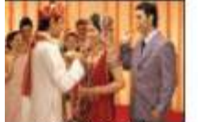
MATRIMONIAL BRIDE WANTED

Saving 10,000/- for high stium, extra eam and -oreign trip opportunity, 238904001. Independent business work from home, train- ing in Singapore, 338014287.