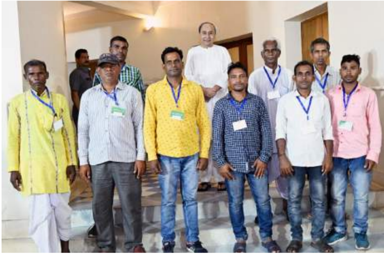
Chief Minister Shri Naveen Patnaik Interacting with KALIA farmers on augmenting livelihood activities