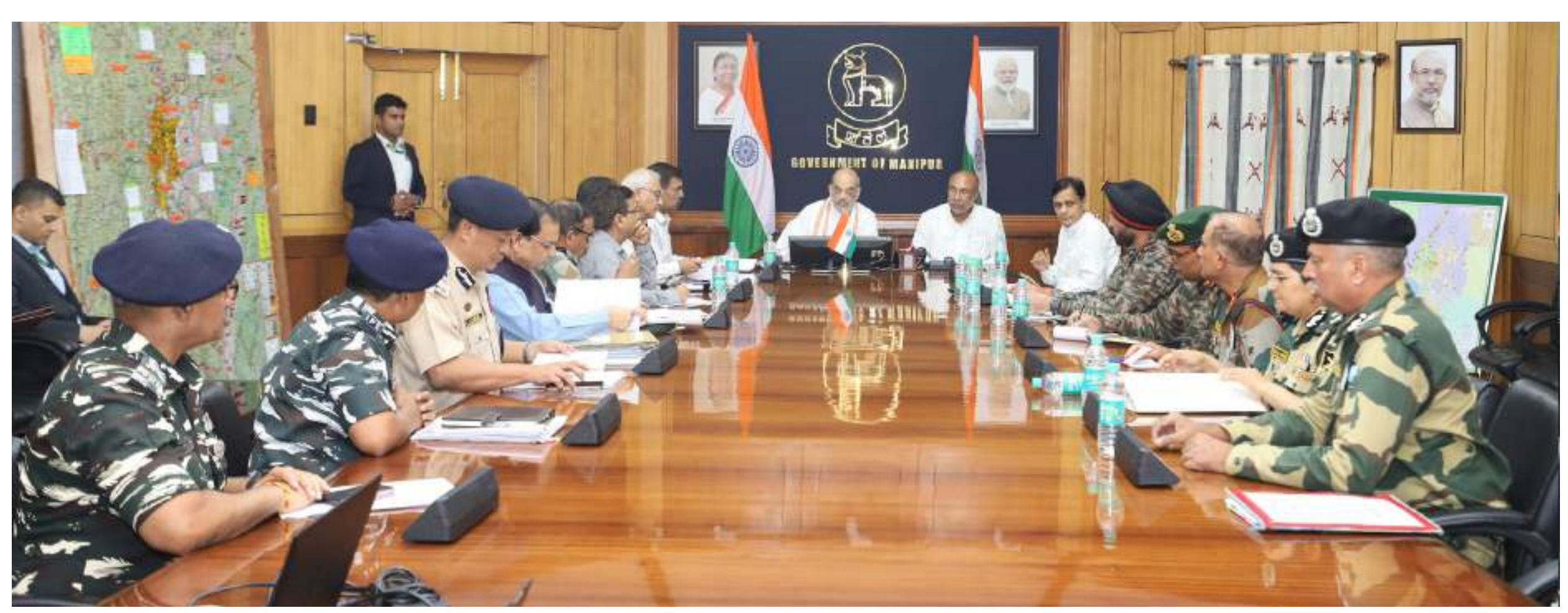
The Union Minister for Home Affairs and Cooperation, Shri Amit Shah reviewed the security situation with senior officials of Manipur Police, CAPFs and Indian Army at Imphal, in Manipur