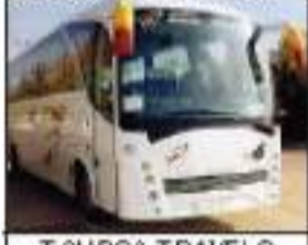
TOURS & TRAVELS

BRIDE WANTED Wanted bride for Chandayat Boy, 37plus, Waste no bar, 0674-2555763