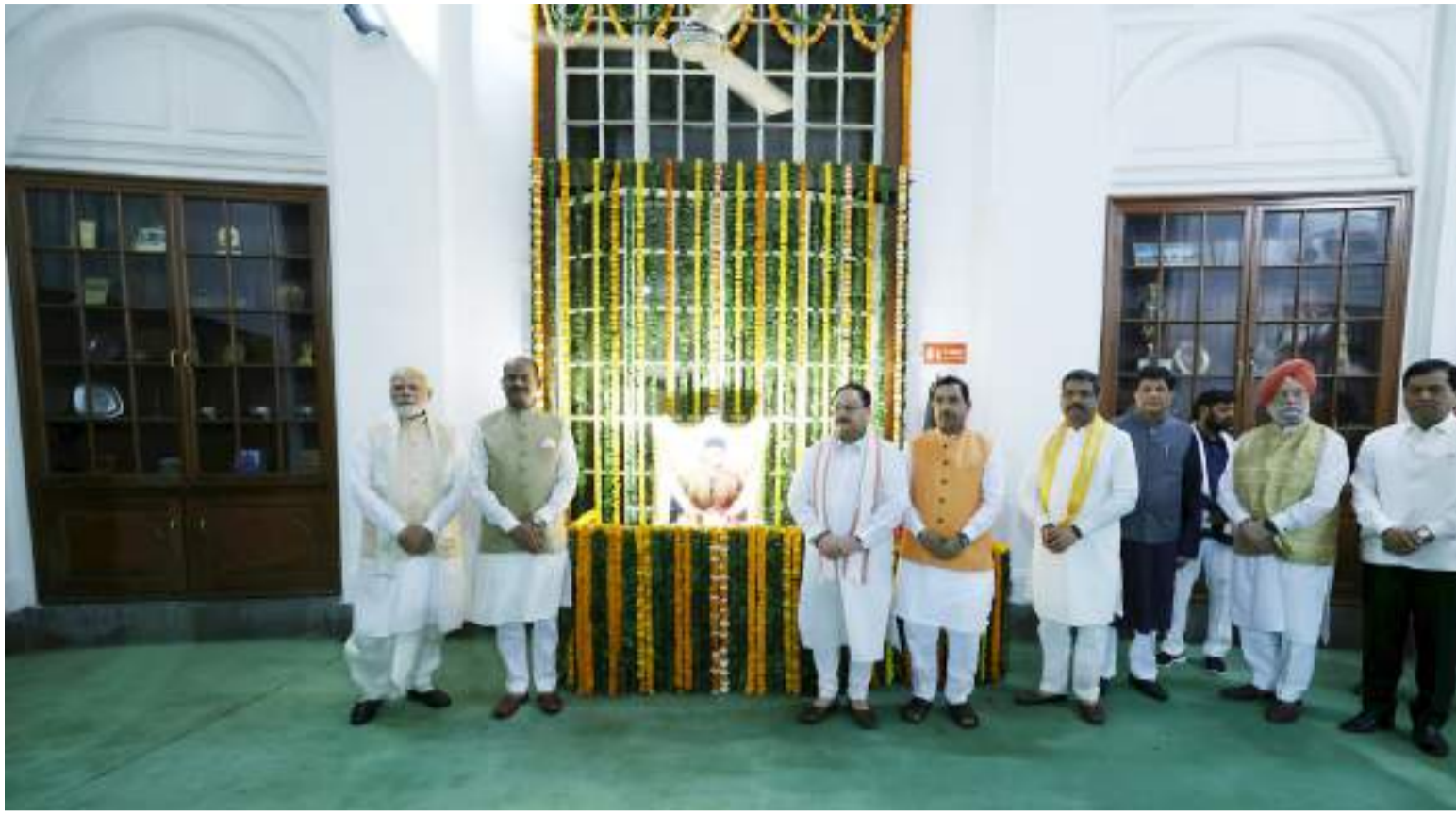
PM pays tribute to Veer Savarkar on his birth anniversary, in New Delhi