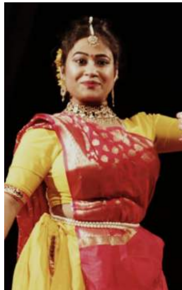
Kolkata, West Bengal India