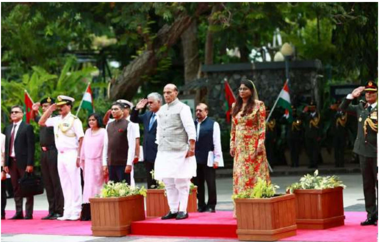
The Union Minister for Defence, Shri Rajnath Singh paying homage at the 3rd November Memorial flag mounting ceremony in Male

addressed a public meeting in Dausa in February after dedicating the Delhi-Dausa-Lalsot section of the Delhi-Mumbai Expressway. With just a few months left before the assembly elections, other senior leaders will also start visiting Rajasthan to hold meetings with BJP workers after the polls in Karnataka, party sources said. Arun Singh, the BJP's national general secretary and Rajasthan in-charge, will camp in the state to prepare for the visits of the party's central leaders, the sources said.