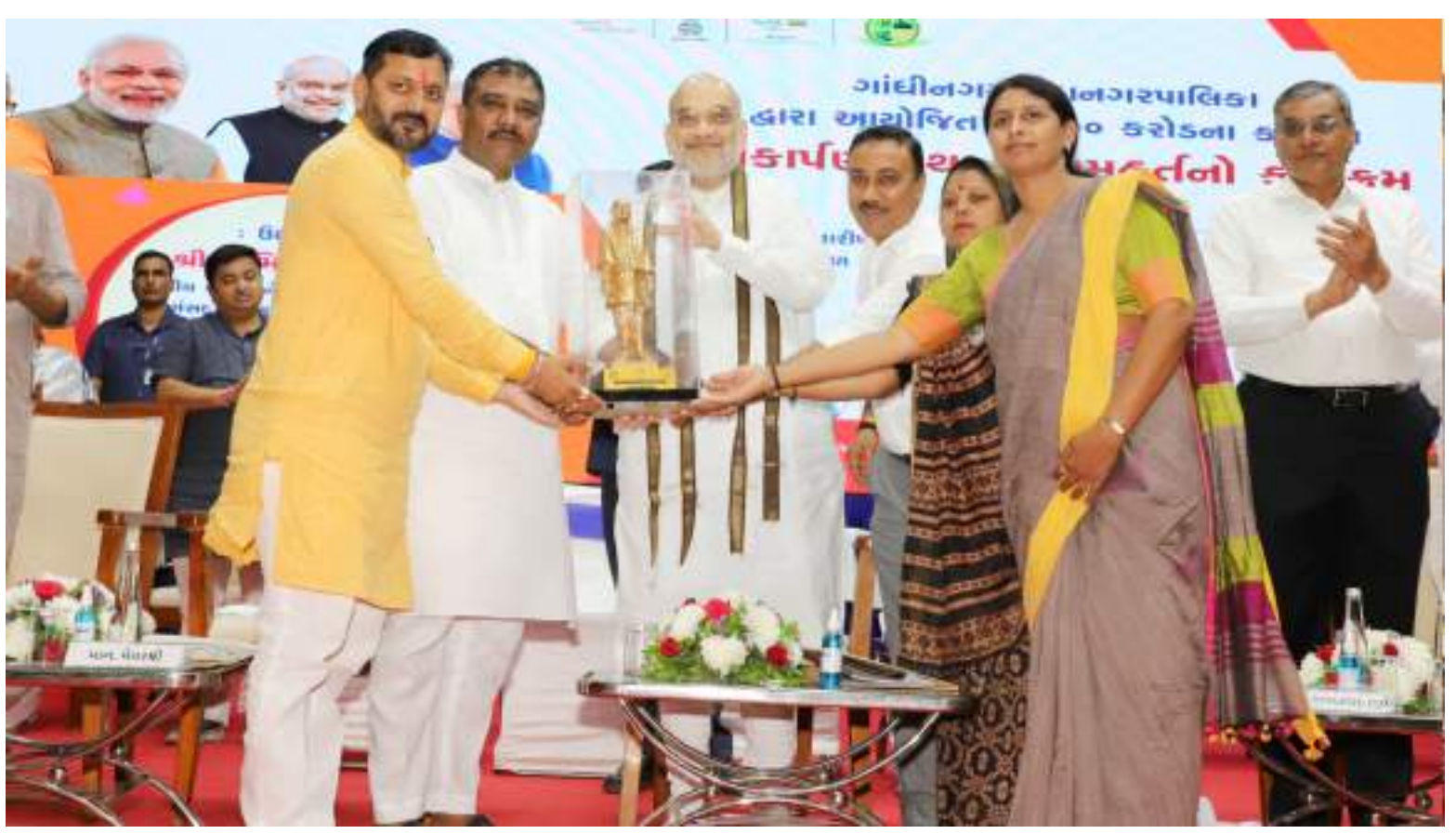
The Union Minister for Home Affairs and Cooperation, Shri Amit Shah attends the event of inauguration and foundation stone laying of various development projects of GMC at Gandhinagar, in Gujarat