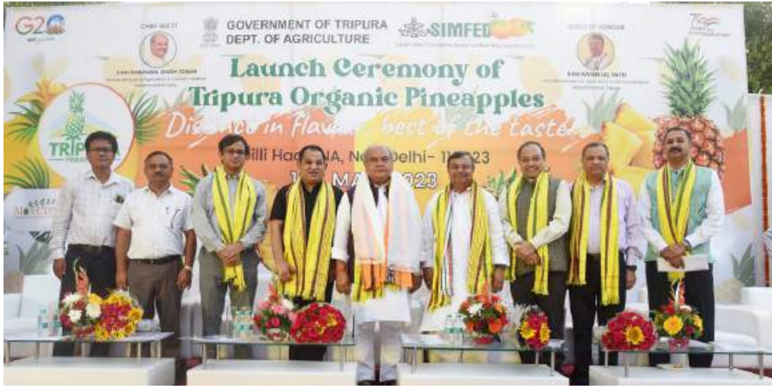
The Union Minister of Agriculture and Farmers Welfare, Shri Narendra Singh Tomar attends the launch ceremony of Tripura Organic Pineapples at Dilli Haat (INA), in New Delhi