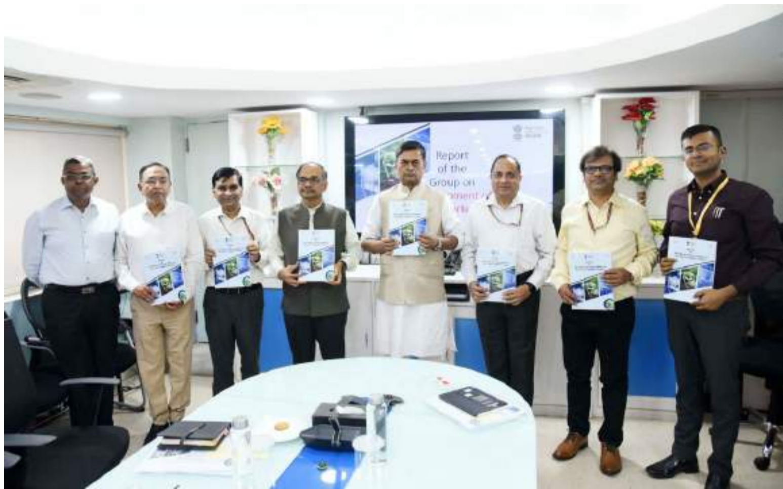
The Union Minister for Power, New and Renewable Energy, Shri Raj Kumar Singh being handed over a Report of the Group on 'Development of Electricity Markets in India' during a meeting at Shram Shakti Bhawan, in New Delhi