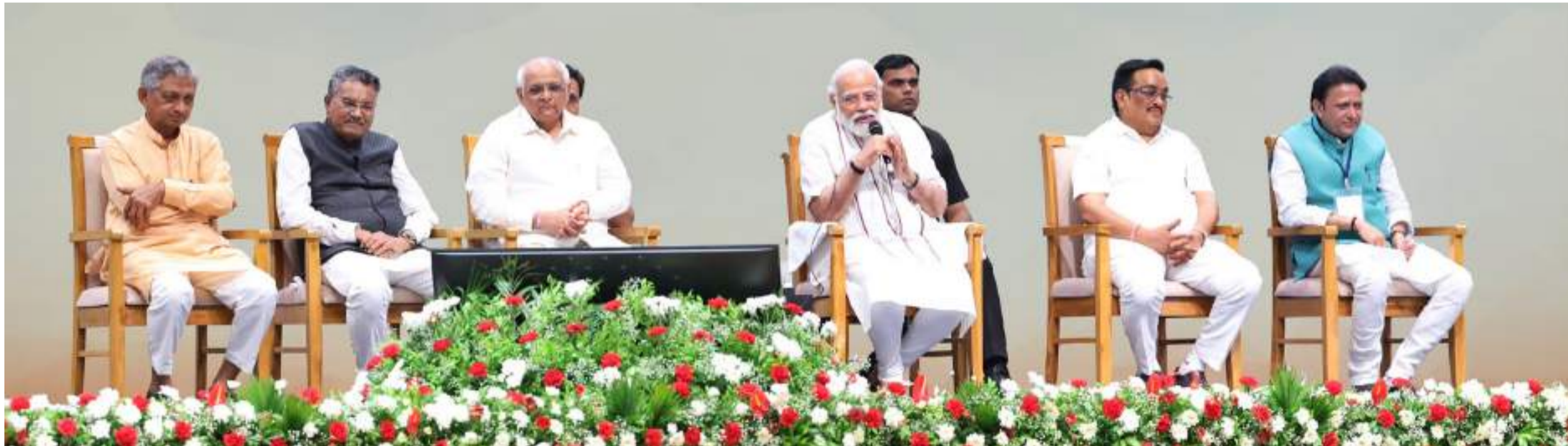
PM addressing at the inauguration and laying the foundation stone of various projects at Gandhinagar, in Gujarat