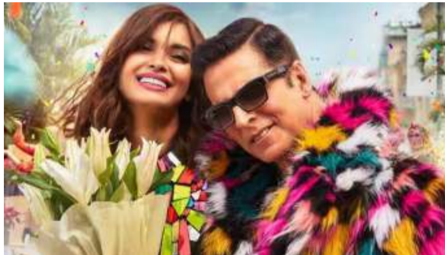
his next 'party anthem'. The song video features Akshay and

Actor Akshay Kumar unveiled the third track Kudi Chamkeeli of his upcoming family entertainer film Selfiee. Taking to Instagram, Akshay shared a full song video titled Kudi Chamkeeli and captioned it, "Heere ki chamak bhi iss #KudiChamkeeli ke saamne fail hai. Full Song Out Now! #Selfiee in cinemas on 24th Feb." Sung and written by Yo Yo Honey Singh, it's