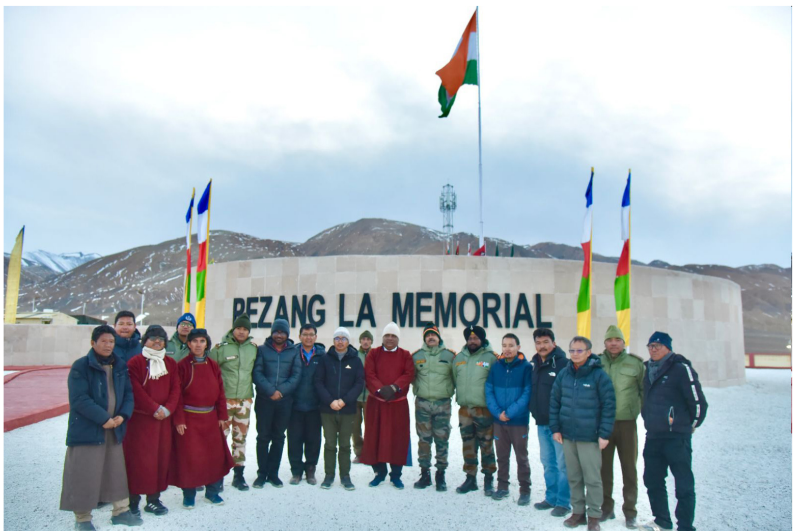
The Union Minister for Environment, Forest & Climate Change, Labour & Employment, Shri Bhupender Yadav at the Rezang-La War Memorial, in Ladakh

examination, list of online examination centres and mock tests will be available on the website, she added. TSICET is conducted for admission to the first year of MBA and MCA courses in the universities in the State. The Test is scheduled to be held on May 26 and 27.