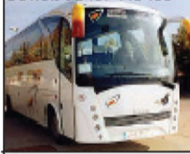
TOURS & TRAVELS

ACCOMMODATION WANTED Required Single / Double / Triple Storied North/East facing building at Puri. Contact 9437143483