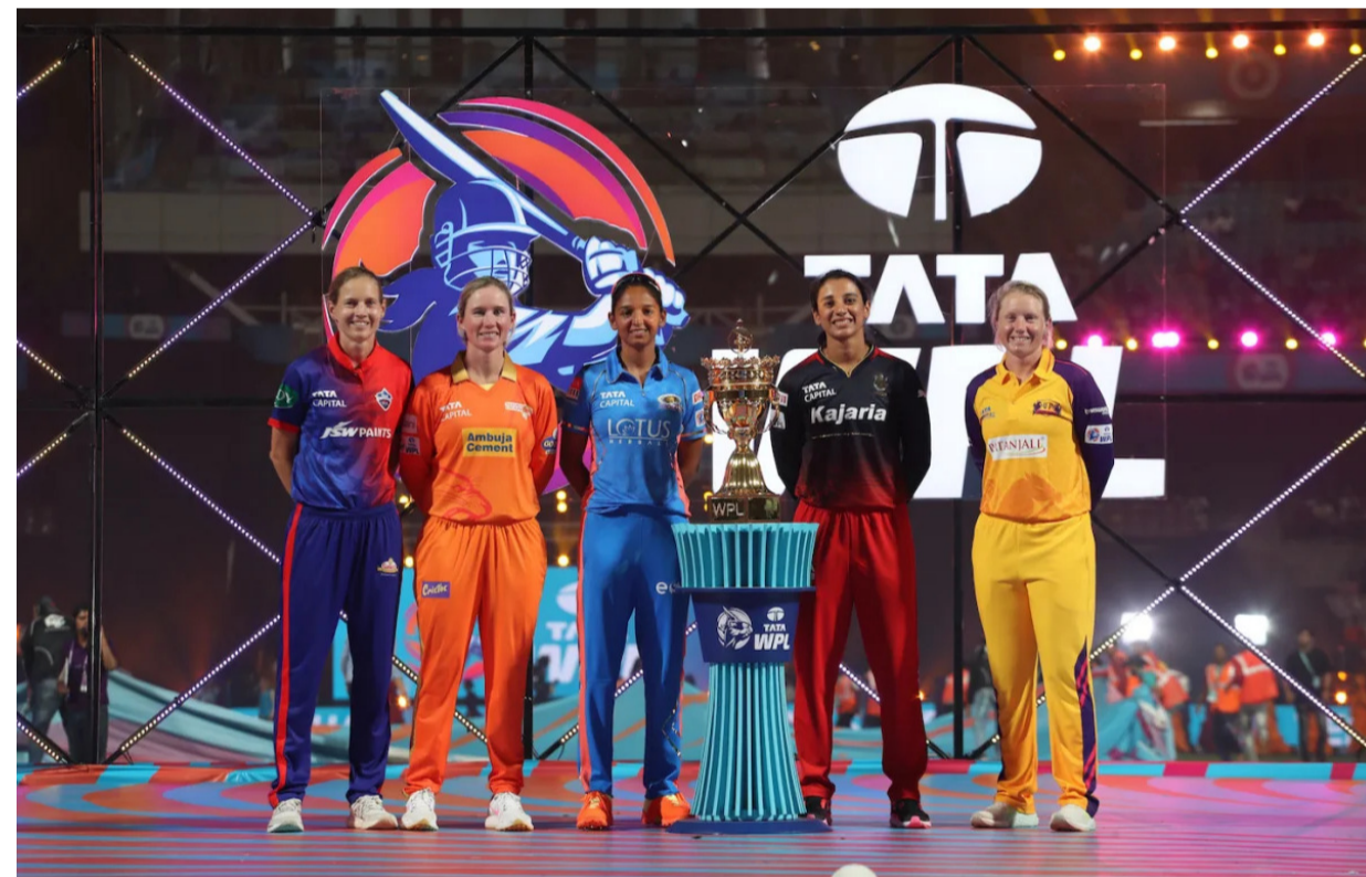
Meg Lanning, Beth Mooney, Harmanpreet Kaur, Smriti Mandhana, and Alyssa Healy pose with the trophy

have any alarming concerns over the surface post the game. "Honestly this pitch talk is just getting too much," Rohit had said after the game. "Everytime we play in India, there's only the focus on the pitch. Why are people not asking me about Nathan Lyon, how well he bowled. How Pujara played in the second innings? How well Usman Khawaja played. Those are the things, if you ask me, I can give you details of. Not the pitch. We focus too much on the pitch here in India. I don't think it's necessary."