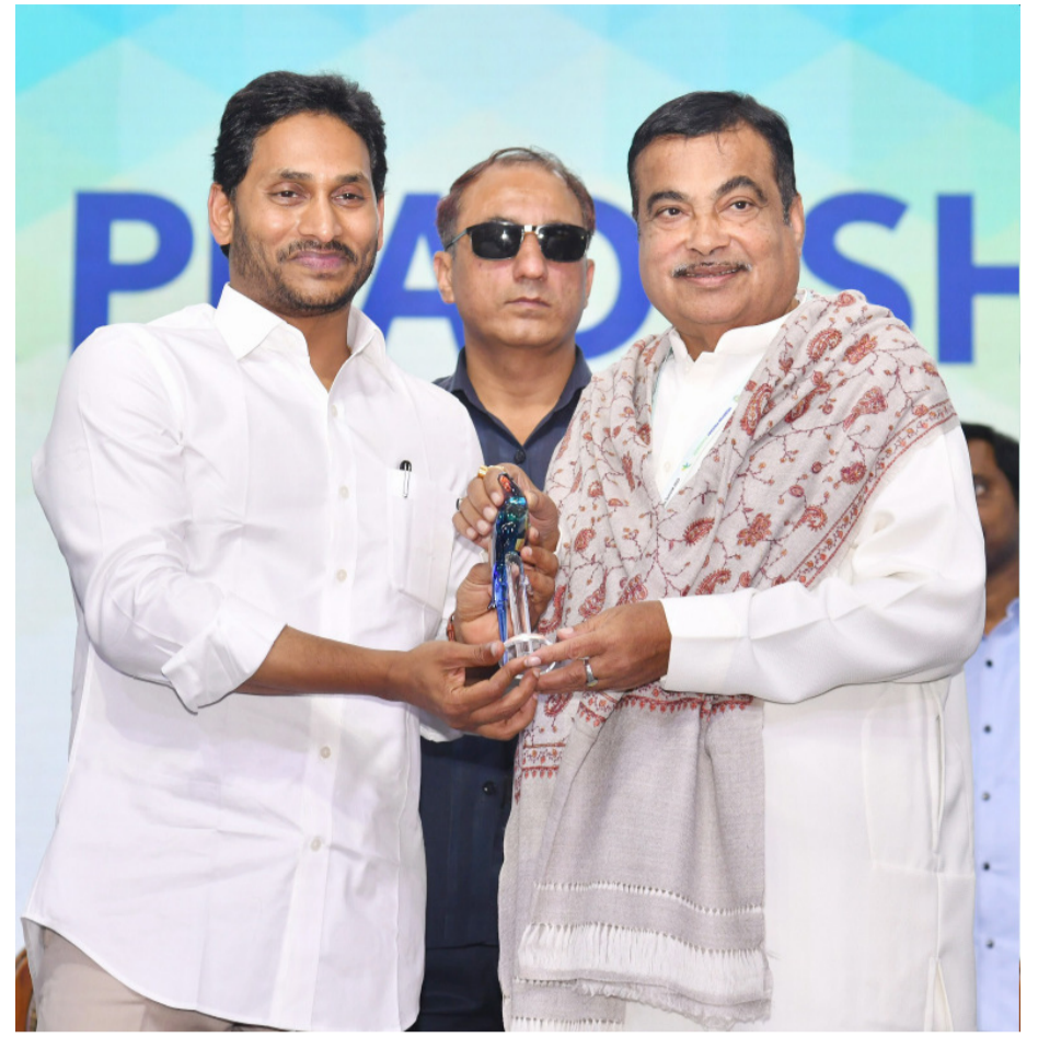
The Union Minister for Road Transport and Highways, Shri Nitin Gadkari being received by Andhra Pradesh Chief Minister, Shri Y.S. Jagan Mohan Reddy at the Global Investors Summit 2023 being held at Visakhapatnam, in Andhra Pradesh

government will come to power with majority. At the same time, it is certain that the BJP coalition government will be formed in Kerala as well. After lakhs of propaganda by the opposition parties People are also with Modi ji and BJP's victory caravans is increasing continuously. He said that the public is fed up with the anti-people government of Telangana and in the upcoming assembly elections, the Modi factor and the efficient leadership of JP Nadda will enthrone the BJP in Telangana with a huge majority.