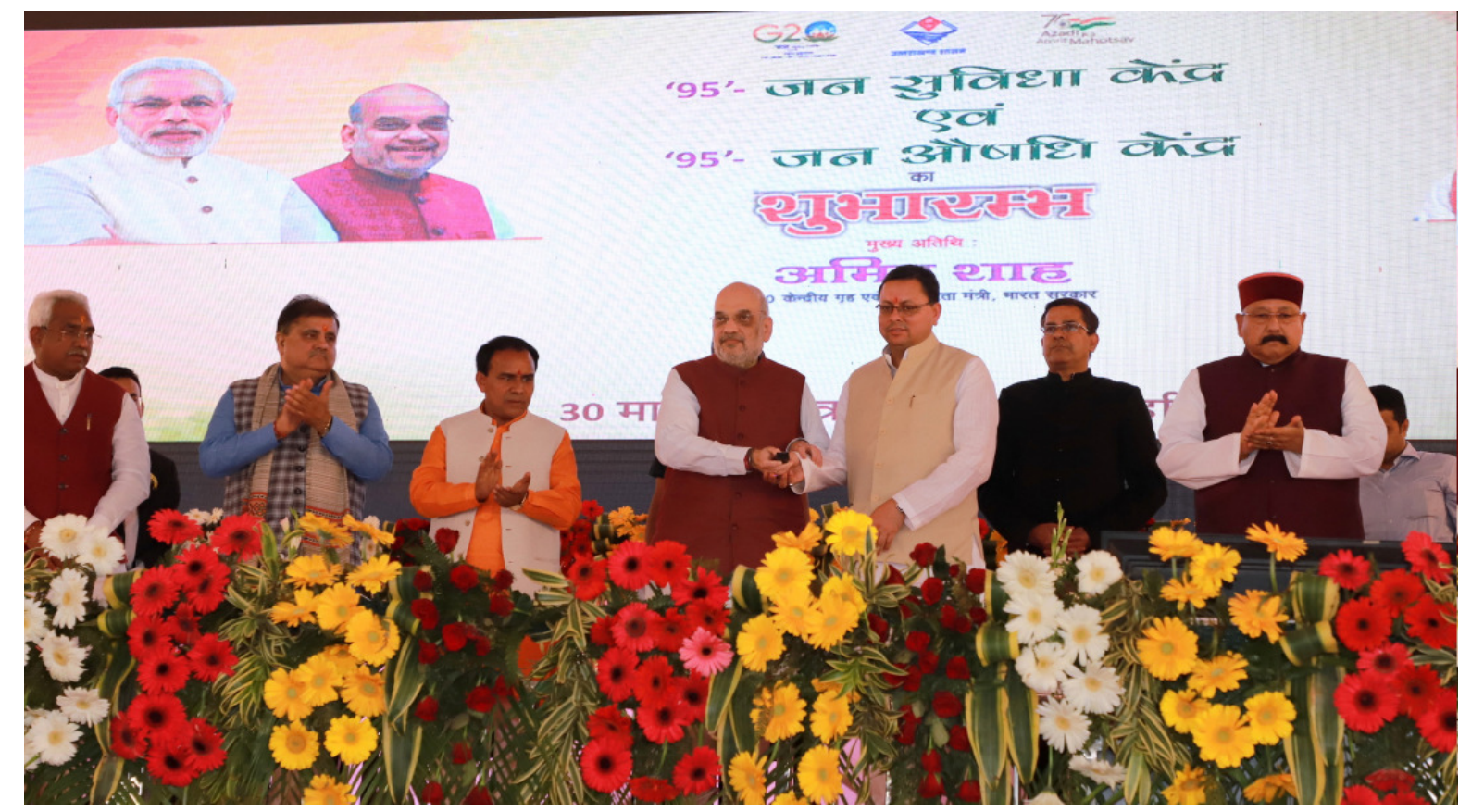
The Union Minister for Home Affairs and Cooperation, Shri Amit Shah inaugurates several development works including computerization of Multipurpose Primary Agricultural Credit Cooperative Societies (MPACS), in Uttarakhand

Allahabad High Court "Today Rahul Gandhi his bungalow. Why is he saying all this? When Indira ii lost in 1977, and she was not requested (former Minister) immediately allowed Willingdon Crescent.