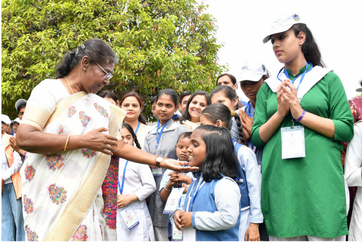
The President of India, Smt. Droupadi Murmu interacts with differently-abled students including visually impaired children at Amrit Udyan and Tactile Garden at Rashtrapati Bhavan, in New Delhi