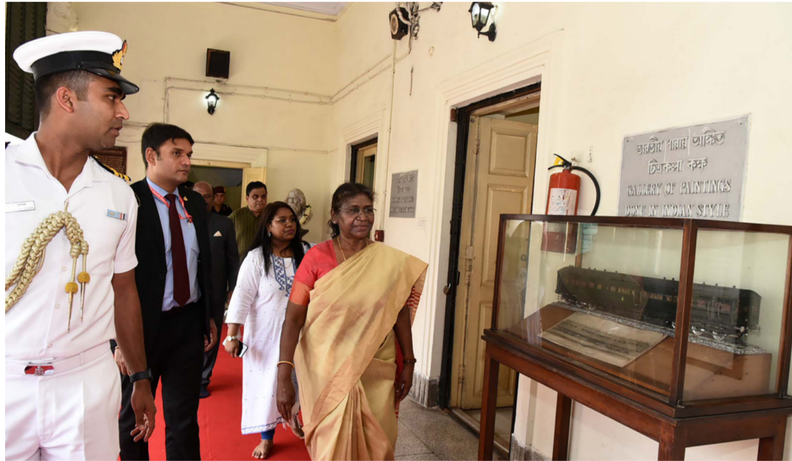
The President, Smt. Droupadi Murmu visits Netaji Bhawan, in West Bengal

- small clay figurines, clay sculptures in the round, but the most notable ones are the plaques. Terracotta or burnt or baked soil is a tradition that traces its roots to the 8th century. It started from Panchmura village in Bishnupur under the Malla dynasty. Due to the short supply of stones in Bengal, burnt clay bricks became a substitute and the unique craft of 'terracotta' was born.