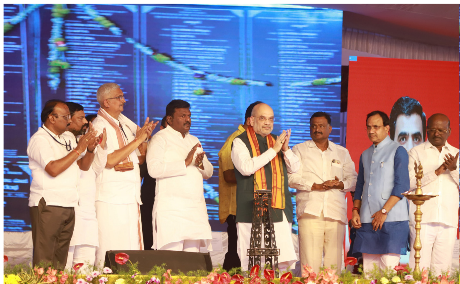
The Union Minister for Home Affairs and Cooperation, Shri Amit Shah inaugurates and lays foundation stone of 236 development projects worth Rs.4500 crore at Raichur, in Karnataka