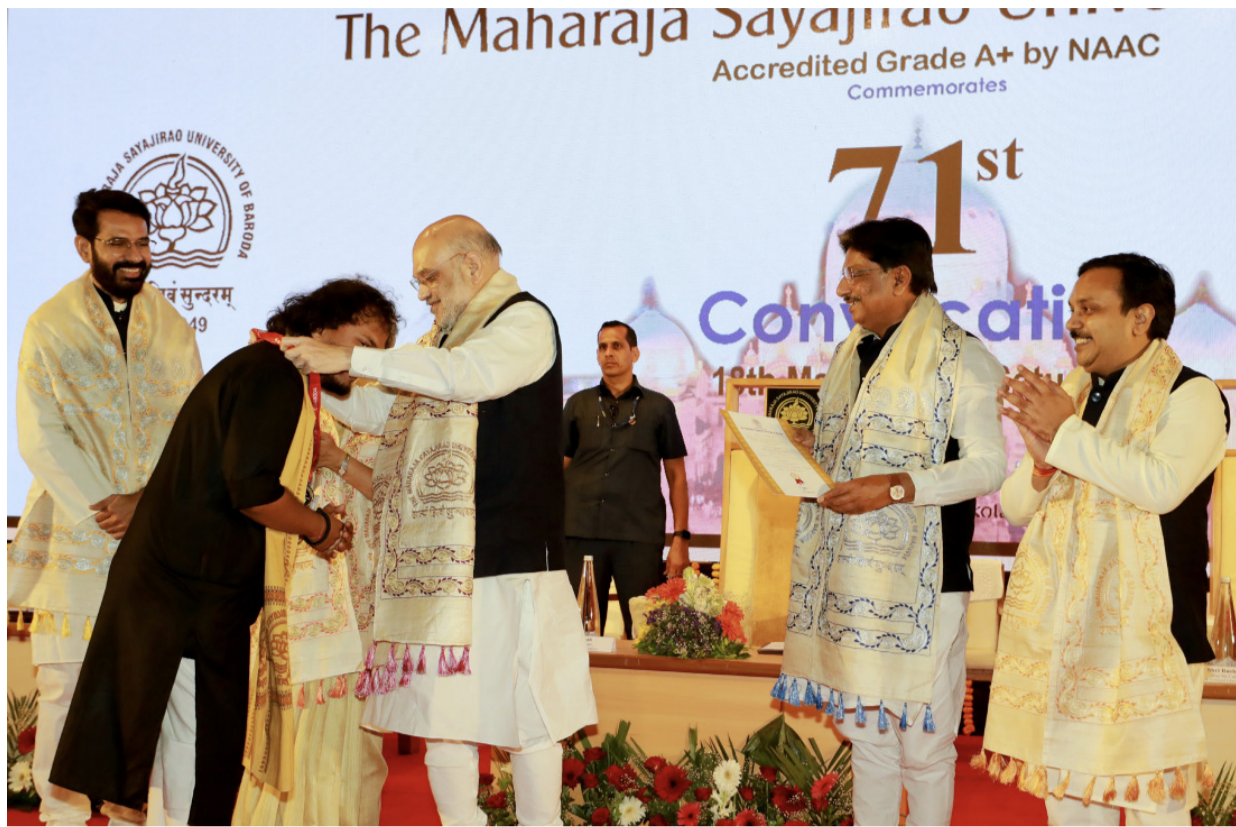
The Union Minister for Home Affairs and Cooperation, Shri Amit Shah attends the 71st Convocation of Maharaja Sayajirao University, as the Chief Guest at Vadodra, in Gujarat