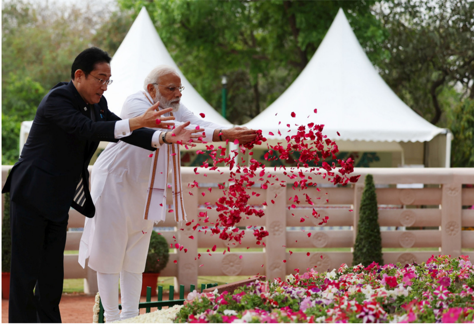
PM visits Buddha Jayanti Park with the Prime Minister of Japan, Mr. Fumio Kishida, in New Delhi