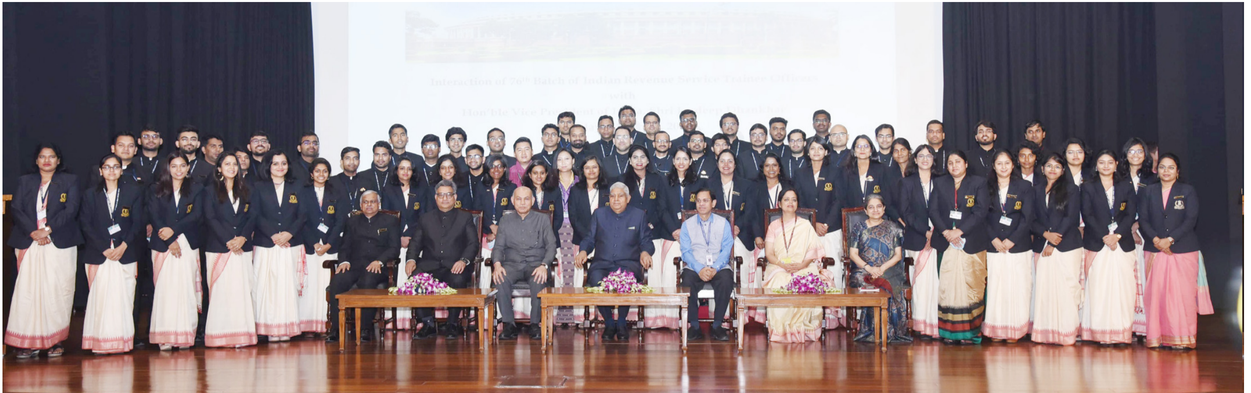
The Vice President, Shri Jagdeep Dhankhar with the group of Officer Trainees of the 76th batch of Indian Revenue Services at Parliament House Complex, in New Delhi