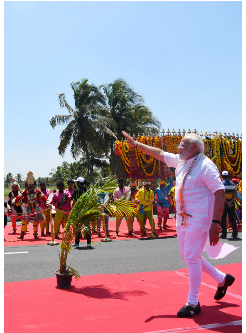
PM receives grand welcome on his arrival at Mandya, in Karnataka