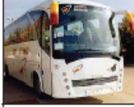
TOURS &amp; TRAVELS

Required Single / Double / Triple Stored North/East facing building at Puri. Contact 9437143483