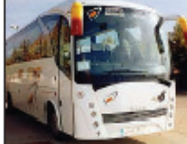
TOURS &amp; TRAVELS

Required Single / Double / Triple Stored North/East facing building at Puri. Contact 9437143483