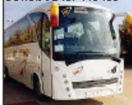
TOURS & TRAVELS

Required Single / Double / Triple Stored North/East facing building at Puri. Contact 9437143483