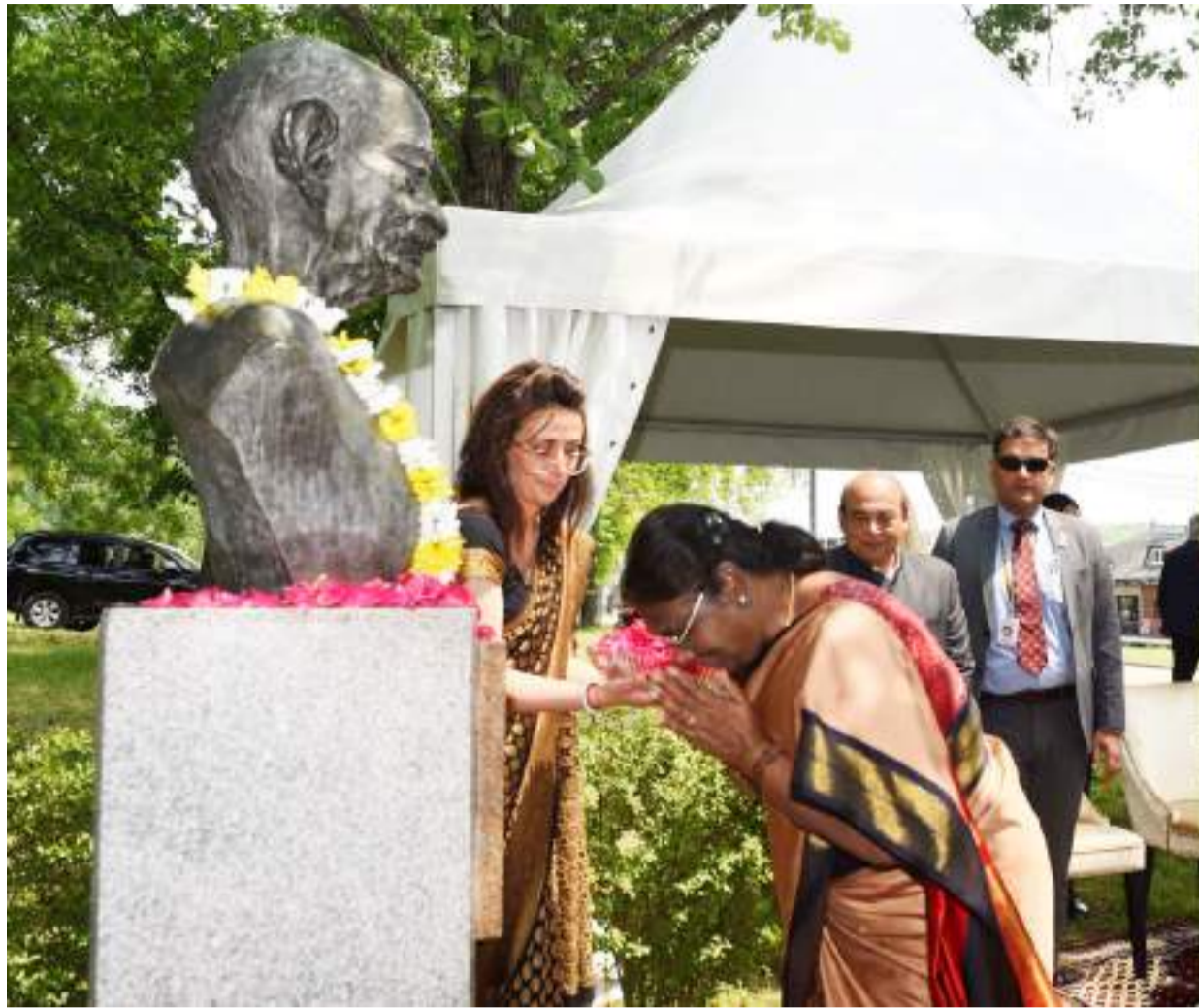
The President of India, Smt Droupadi Murmu pays floral tribute to Mahatma Gandhi at Belgrade, in Serbia