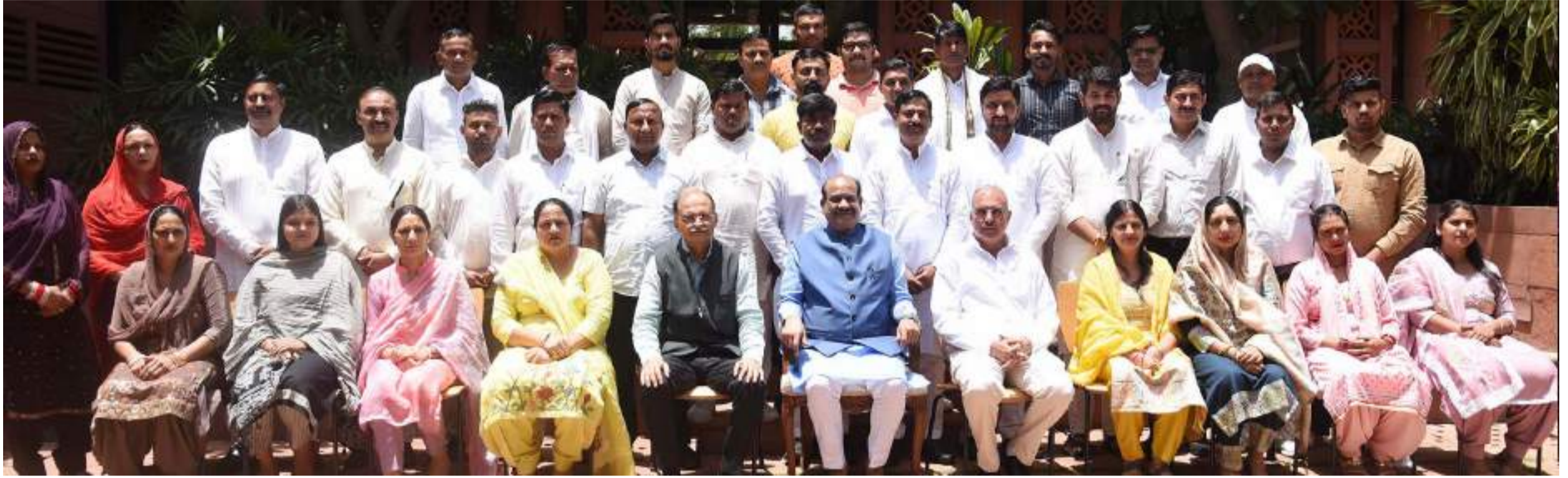
The Speaker of Lok Sabha, Shri Om Birla in a group photograph with Panchayat Raj representatives of Karnal (Haryana), in New Delhi