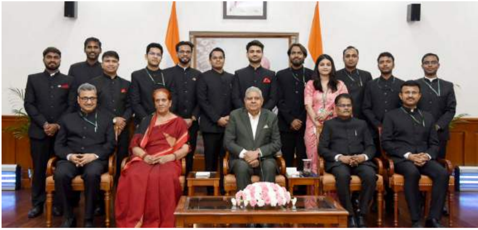
The Vice President, Shri Jagdeep Dhankhar with Officer Trainees of the Indian Defence Estates Service (IDES) at Upa-Rashtrapati Nivas, in New Delhi