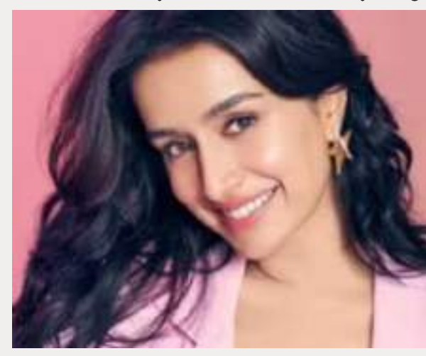
set to have a festive March 2023.