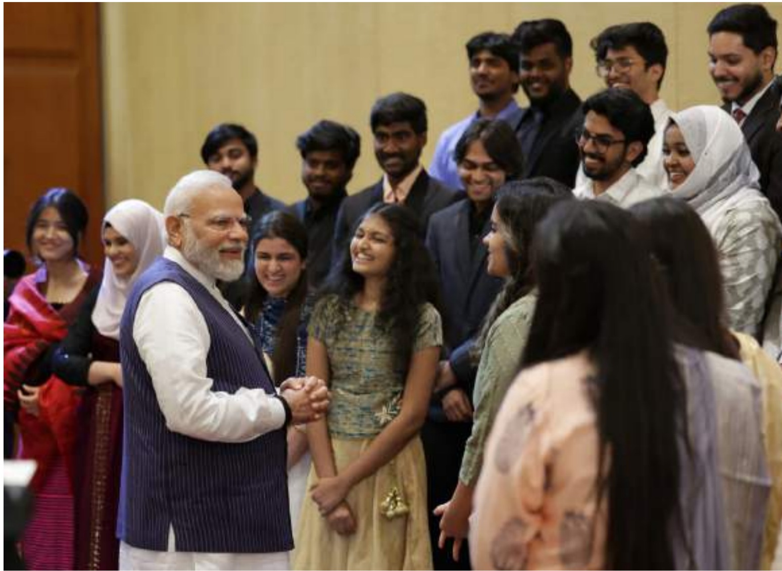
PM interacting with the Indian Community, in Cairo, Egypt