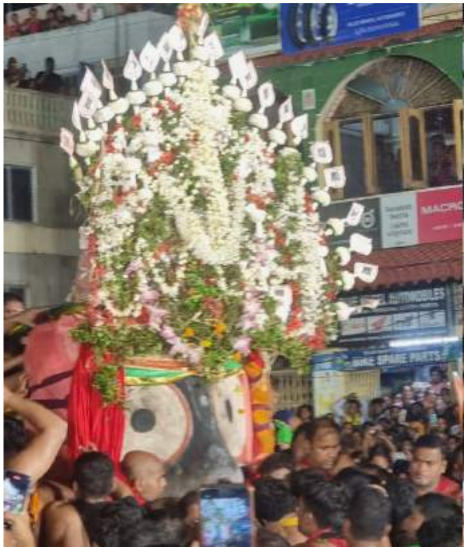
Mahaprabhu Jagannath in Adapa Mandap