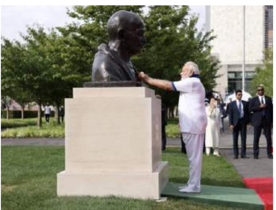
PM pays floral tribute to Mahatma Gandhi bust at UN Headquarters ahead of the 9th annual International Day of Yoga 2023 celebrations, in New York

Schools will reopen on June 23 in Nuapada district.